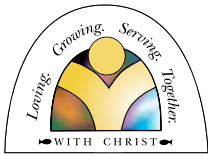
Lodi Presbyterian Church